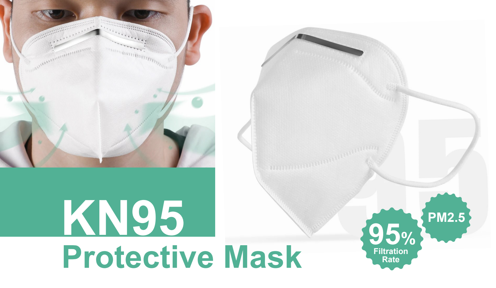
Ergonomic Mould Design for comfort use